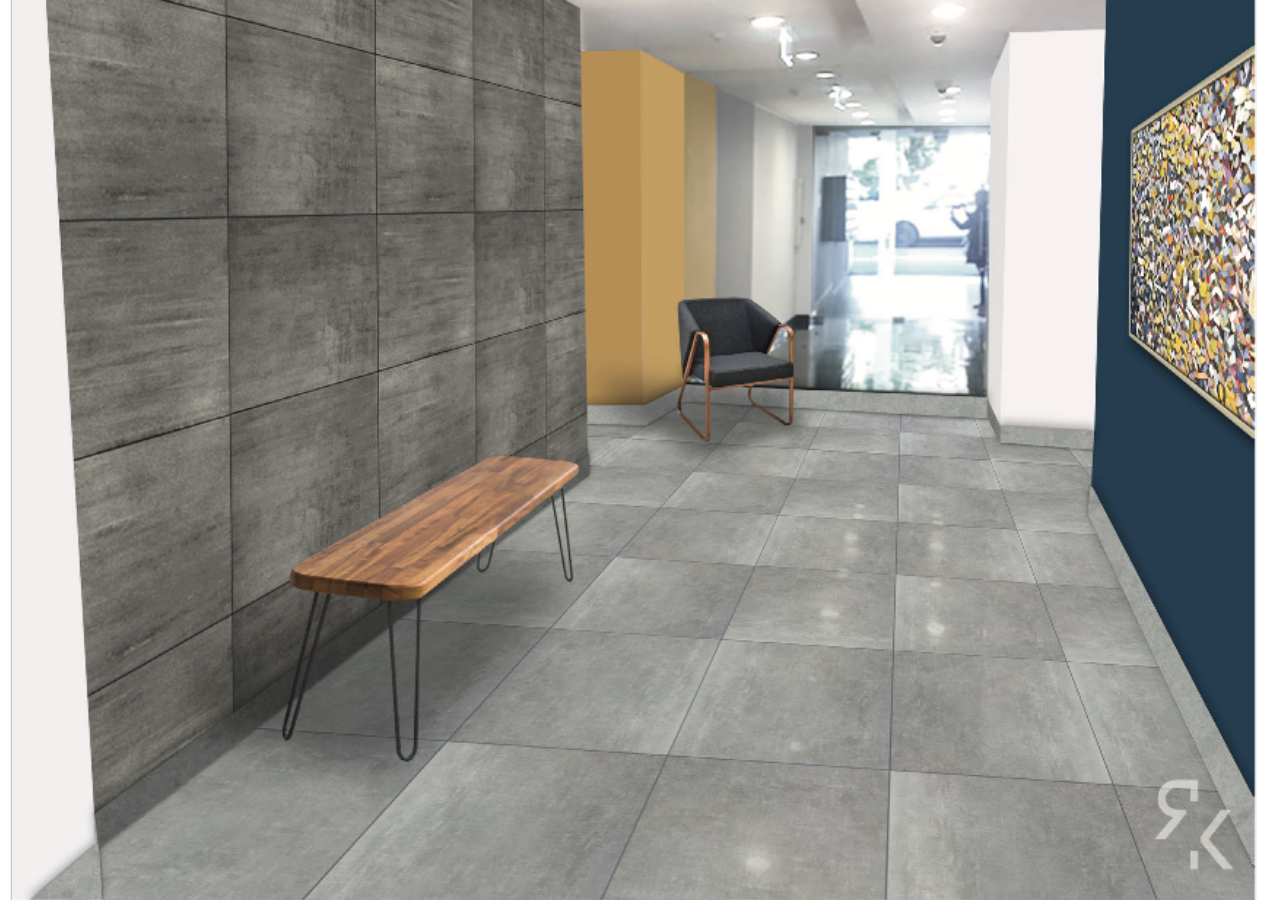
PROPOSED COLOUR SCHEME 1 - CONTEMPORARY